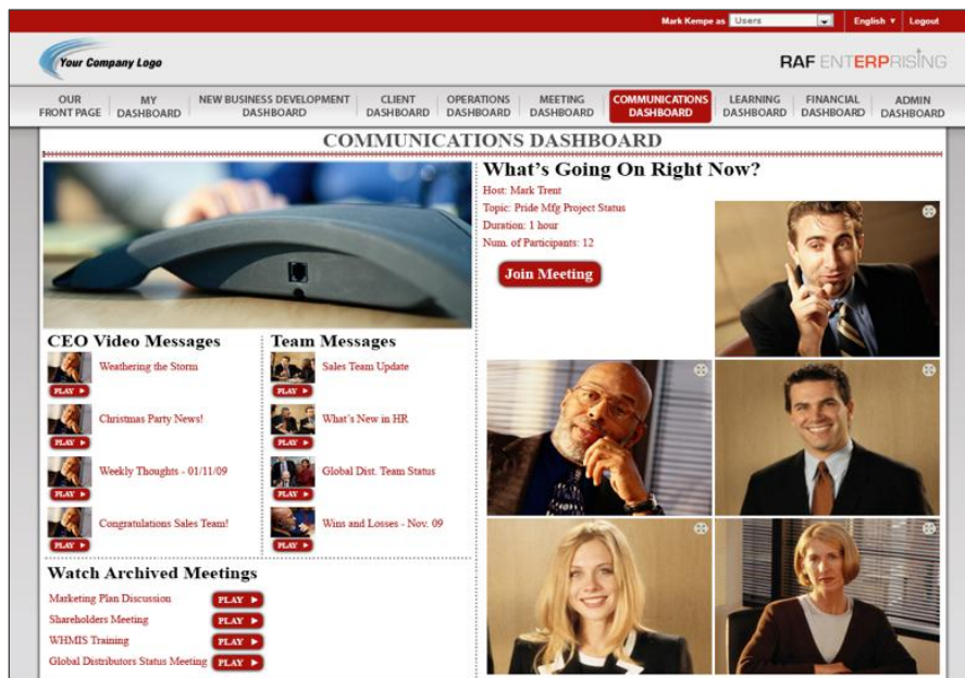
Figure 2: Example of a communications dashboard in MYBUSINESSOS.

MYBUSINESSOS is a cloud-based application that’s accessible at any time, from any Web browser. You can instantly collaborate with colleagues, customers, suppliers, and partners, even if they’re halfway around the world. You can also monitor critical business metrics in real time on your smartphone or tablet, even if you’re halfway around the world.